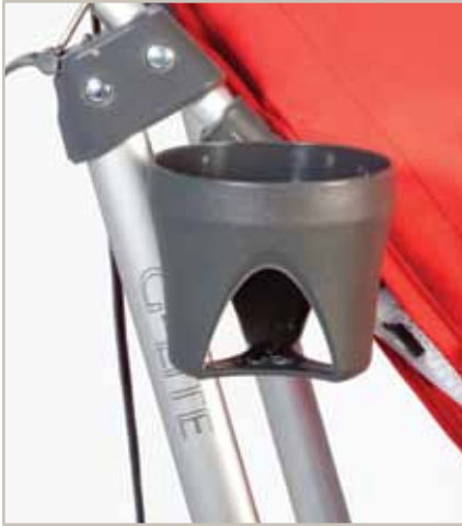
Removable cup holder that can be positioned on right or left side