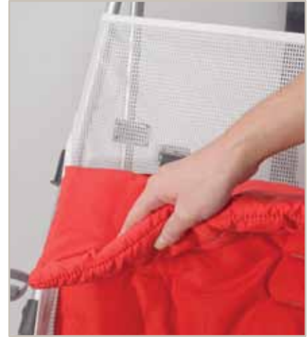
Quick-remove washable seat pad

8.8 lbs – defining a new class of lightweight strollers