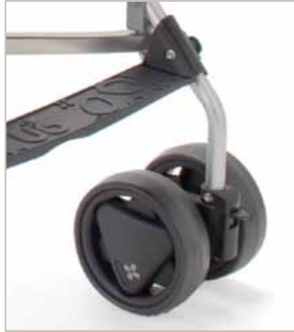
4-Wheel, shock-absorbing suspension