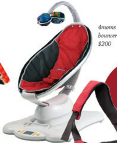
4moms bouncer $200