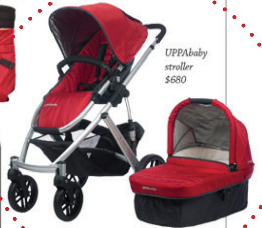
UPPAbaby stroller $680