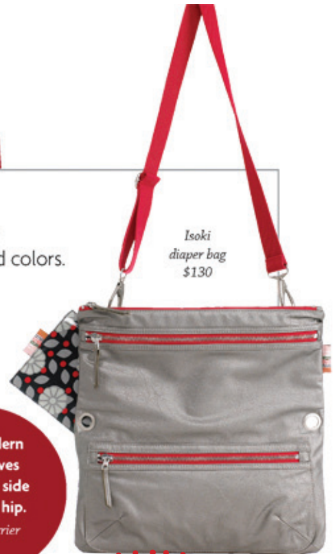
Isoki diaper bag $130

The modern mom loves when her side carrier is hip.