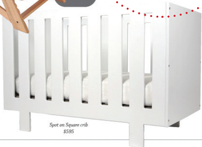
Spot on Square crib $595