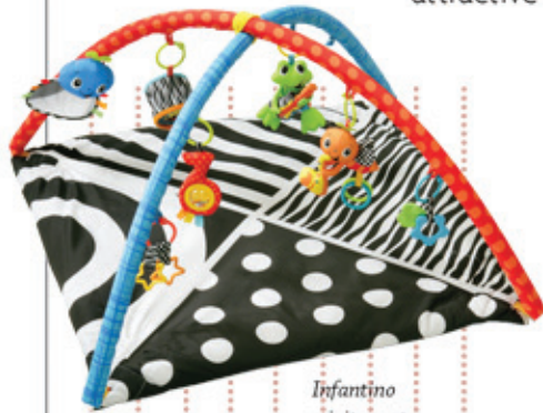
Infantino activity mat $60

The modern mom values style and function. She streamlines her life by acquiring gear that's as practical as it is attractive and tends toward clean lines and bold colors.