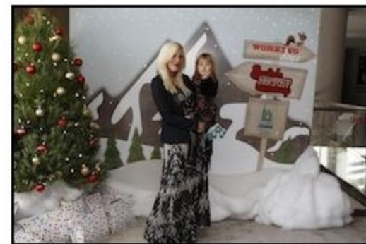
Tiffani Thiessen, Daughter and Santa